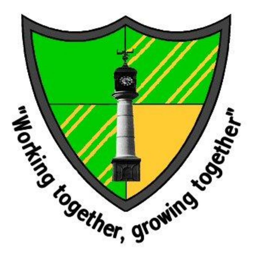
Adopted by Governing Body : Autumn Term 2023 Next Review : Autumn 2025